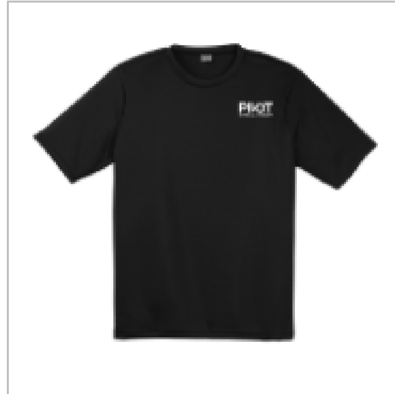
♥ Men's Sport-Tek Tee TECH's ONLY - Black ⓘ

View: Items per page: 12 Displaying 1-12 of 22 Page 1 / 2