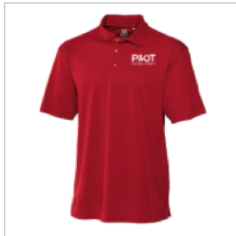
♥ Men's DryTec Genre Polo - Cardinal Red ⓘ