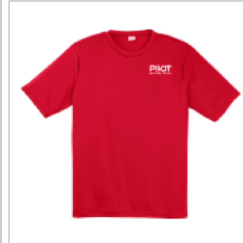
♥ Men's Sport-Tek Tee TECH's ONLY - Cardinal Red ⓘ