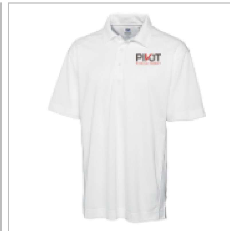
♥ Men's DryTec Genre Polo - White ⓘ